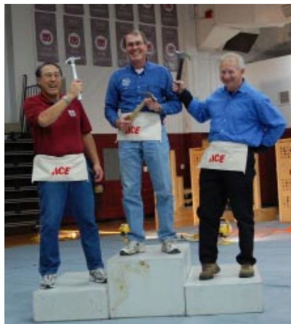
Gold, Silver and Bronze hammers are awarded to the top three in the 2010 ACE Hardware Coaches Match. The match gives athletes a chance to cheer and cry over the performance of their coaches.

Rifle Classic Decals: Each competitor will receive a unique tournament decal as a memento. The decals have become collector's items that are applied to rifle stocks and gun cases.