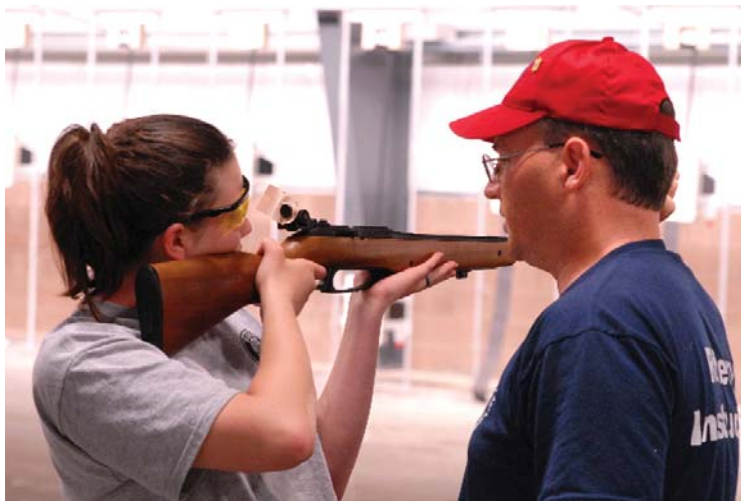
Closely observing new shooters while they shoot can usually detect fundamental errors in shot technique.

Step 1, Support Arm Elbow Placement. Placing the elbow of the support arm in the correct location of the support elbow contributes significantly to the stability of any firing position. If the elbow is in the right place, the support arm or support arm and sling will be configured in such a way that muscle effort is not needed to hold up the rifle. Conversely, if the elbow is in the wrong place, shaky muscles are likely being used to hold up the