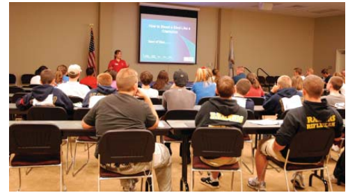
Camp counselors present several instructional topics and activities during the Summer Camp Program.

A formal competition (3x20 plus final) will be conducted on the last day of each camp. Medals will be awarded for both sporter and precision classes after