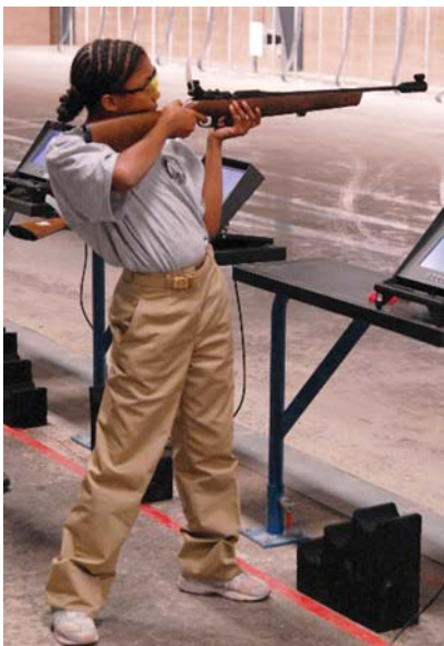
Correcting Errors--Solving Challenges for the New Shooter.....Page 6

NON-PROFIT ORG. U.S. POSTAGE PAID PERMIT NO. 576 PORT CLINTON, OH 43452