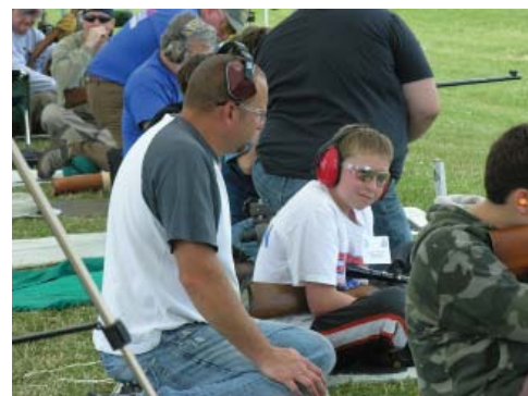
The National Rimfire Sporter Match will feature a new Youth-Adult Partner Match.

This competition offers juniors and adults an opportunity to compete with sporter-class smallbore rifles like those used in many 4-H Shooting Sports and junior club programs. Rimfire Sporter