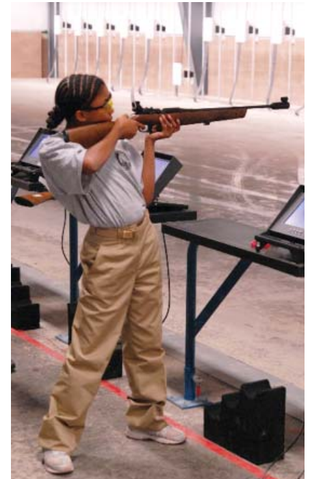
All coaches who work with new shooters need a good understanding of fundamental position checkpoints such as elbow placement, head position and proper sling adjustment.

Kneeling. The best way to check elbow location in kneeling is to look at the support triangle formed by the left arm and sling. If it is vertical, it is right. Some additional position checks are necessary in kneeling to ensure that proper support is given to the rifle. Is the body weight resting back on the heel; if not, try to get the shooter to shift the weight back. Is the left lower leg pulled back? If it is, the left foot needs to be moved forward until the lower leg is at least vertical.