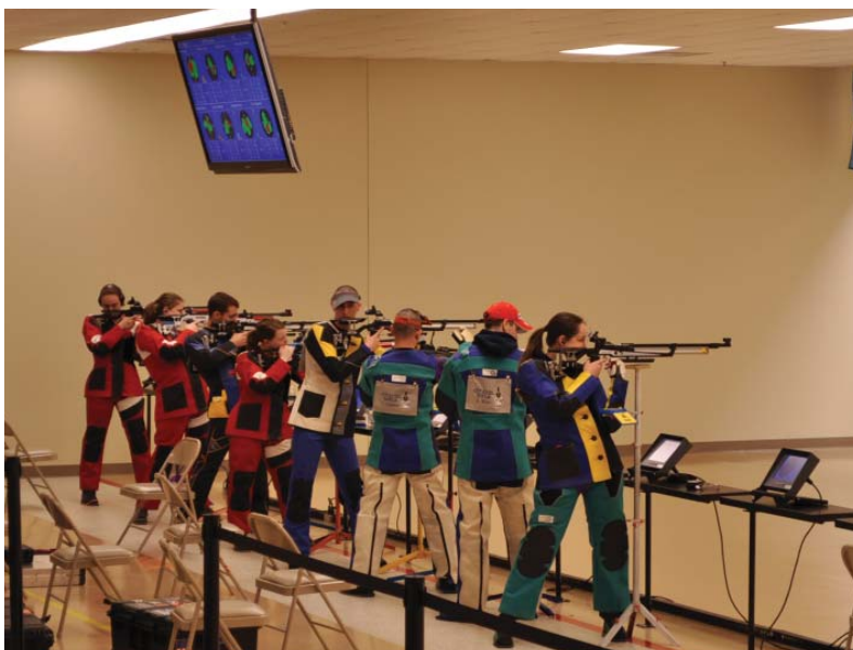
The top eight precision finalists compete in the Final to decide the champion.

Outside of conference matches hosted at the Citadel, the facility at CMP South provides the only other electronic target venue that SEARC shooters participate on during the season. For CMP it is a rare opportunity to work with college shooters. Most collegiate rifle programs compete in both air rifle and smallbore, and CMP does not have an indoor smallbore range. This limits the support CMP can provide to collegiate rifle events, particularly NCAA programs.