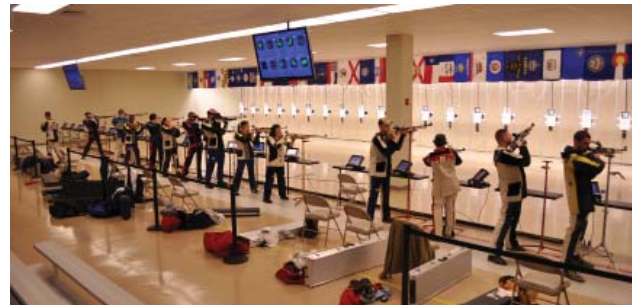
The CMP Marksmanship Center in Anniston, Alabama, hosted the South Eastern Air Rifle Conference. The Air Gun Center is open every Tuesday and Thursday evening for Open Public Shooting. Visit http://www.odcmp.com/MarksmanshipCenters.htm for more information.

Taking the top honors at the SEARC Championship in February was North Carolina State University. The school is one of several NCAA programs that compete in the conference. The Citadel and North Georgia State College and University, also both NCAA programs, rounded out second and third place respectively.