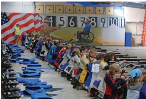
The National Junior Olympic Championships are the major National Championships in three-position air rifle.

USA Shooting, the CMP and the National Three-Position Air Rifle Council sponsor this competition. It is regarded as the major national championship in three-position air rifle. To participate, teams and individuals must qualify in Junior Olympic state championships. These events usually take place in the winter and early spring. Competition is broken into sporter and precision divisions and