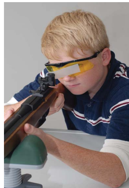
Placing a simple blinder on the rear sight will solve almost all cross-dominance problems.

Step 3a, Firing in Panic or Fear. The third common cause of wild shots that hit completely off of the target occurs when new shooters slap at the trigger, often while closing their eyes. Sometimes, this comes from attempting to fire in an unsteady position. Sometimes, this occurs when new shooters have so little concentration on the sight picture that they simply close their eyes and grab the trigger. Error detection in this case is relatively simple. Stand to the side of the shooter and observe