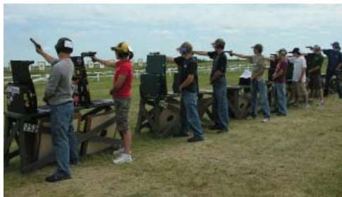
The National Trophy Junior Pistol Matches will take place on 18 July at Camp Perry, Port Clinton, OH.

Like the Junior Olympic Three-Position Air Rifle Championship held at Camp Perry in July, the Progressive Position Air Pistol Championship requires shooters to qualify for the nationals from state championship events held in the winter months. Team and individual titles are awarded and competitors are divided into supported and unsupported categories. A complete program for the 2010 National Junior Olympic Progressive Position Air Pistol Championship and registration can be found at http://www.usashooting.com/youthPistol.php .