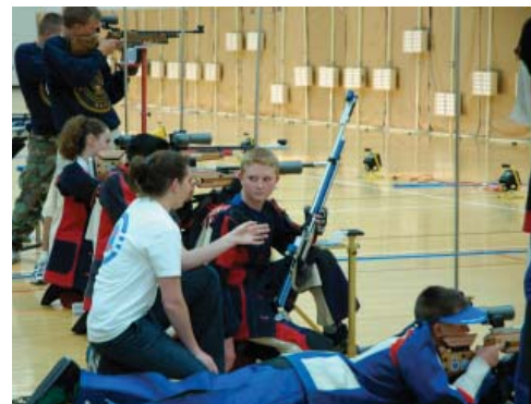
The CMP Three-Position Air Rifle Summer Camps will take place at the CMP Marksmanship Centers in Port Clinton, OH and Anniston, AL.

One of the best ways for juniors to improve their competition scores