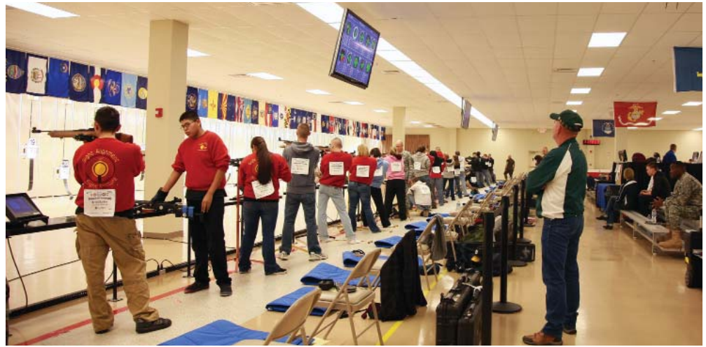
The CMP's Anniston (Alabama) Air Gun Range was the location for the 2010 JROTC National Air Rifle Championship.