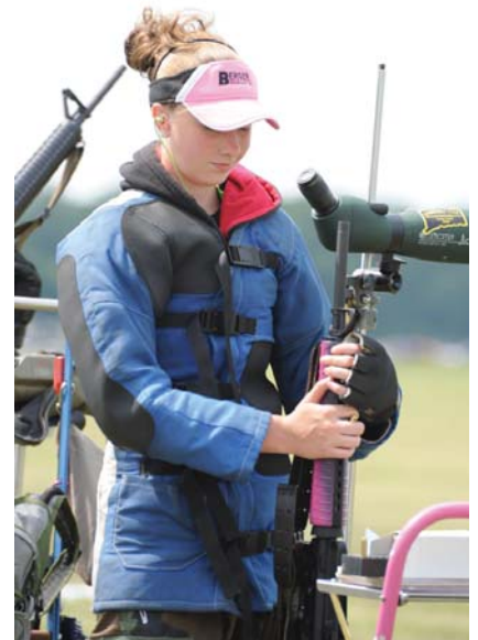
Getting Started in Highpower Rifle.....Page 20