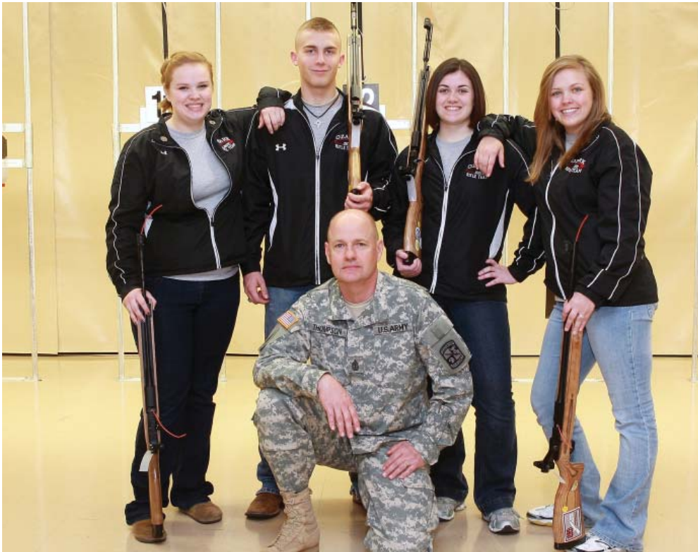
Missouri's Ozark High School Army JROTC took the JROTC Sporter Team Championship with an aggregate total of 4376-151.

For the competition, shooters fired two 3x20 matches over the course of two days. The top eight individuals in both the sporter and precision classes then shot a final on each day and their final average was added to their two-day aggregate score to determine the Individual National Champions in each class. Team scores consisted of the two-day aggregate scores of the four-person teams.