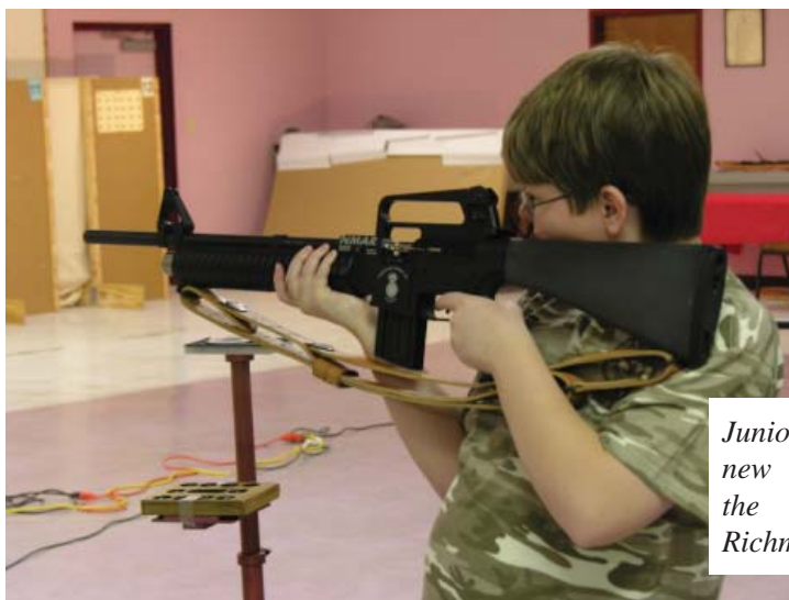
Junior shooters try the new AiR-15 Rifle during the NMAR Match in Richmond, VA.