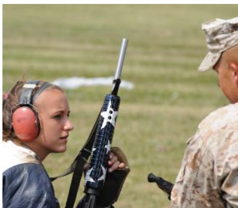
The USMC Junior Highpower Clinic and Rifle Small Arms Firing School will be held during the National Matches at Camp Perry, Port Clinton, OH on 31 July - 1 August.

In addition to the numerous national championships that take place in the summer, there are also smaller competitions that juniors can take advantage of over their break.