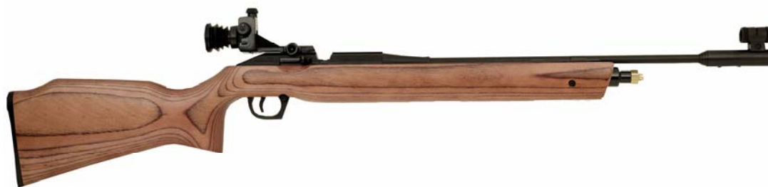
Daisy 887 CO 2 powered Sporter Class rifle—Daisy pneumatic rifles are also legal

⊙ SPORTER RIFLE CLASS. The NMAR Sporter Class is the way to go for adults and juniors who want an accessible, recreation-oriented air rifle competition where equipment costs are low. Any air rifle recognized as a “Sporter Class” rifle by the National Three-Position Air Rifle Council (Daisy 853/753/888/887, Crosman Challenger 2009, AirForce Air Guns Edge) is legal in this class. These air rifles are all available for less than $500. Legal Sporter Class rifles must not weigh more than 7.5 lbs. and their triggers must be capable of lifting 1.5 lbs. Only basic cloth shooting jackets are legal in this class where special equipment is strictly limited. Persons with limited marksmanship training and experience and even new shooters can successfully complete NMAR courses of fire with Sporter Class air rifles.