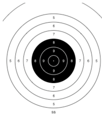
The NMAR SR target is shown here at approximate actual size. Shots touching the dot score "X." Shots touching the first full ring score "10."

IF YOU DON'T HAVE AN AIR RIFLE OR WANT TO TRY A CREEDMOOR AiR-15 AR-CLONE-- Loaner air rifles will be available at the match. If you do not have your own air rifle or especially if you want to try one of the new Creedmoor AiR-15 AR-Clone rifles, loaners will be available at no extra cost. Sporter air rifles will be available for competitors who wish to compete in the Sporter Class. The CMP will provide Creedmoor-Anschütz AiR-15 rifles for competitors who wish to shoot them in AR-Clone Class.