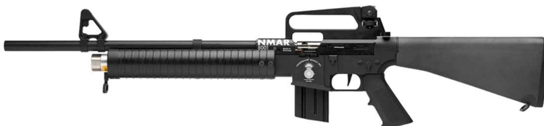
The Creedmoor-Anschutz AiR-15 features an Anschutz M8001 system in a special AR-type stock.

Air rifle pellets cost less than two cents per shot and air rifle ranges can be set up in most homes. For more information on the PCE BF-17 go to their website at http://www.pilkguns.com/menu_ar15.shtml . For more information on the Creedmoor-Anschutz AiR-15, go to their website at http://www.creedmoorsports.com/store/home.php .