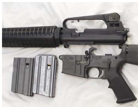
The Pilkington Competition Equipment BF-17 is an upper that fits on an AR lower.

Air rifle pellets cost less than two cents per shot and air rifle ranges can be set up in most homes. For more information on the PCE BF-17 go to their website at http://www.pilkguns.com/menu_ar15.shtml . For more information on the Creedmoor-Anschutz AiR-15, go to their website at http://www.creedmoorsports.com/store/home.php .