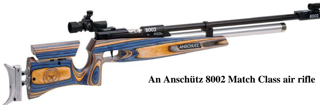
An Anschütz 8002 Match Class air rifle

⊙ MATCH RIFLE CLASS. Any precision air rifle legal for use in ISSF, USA Shooting