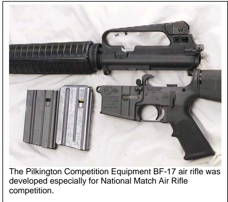
The Pilkington Competition Equipment BF-17 air rifle was developed especially for National Match Air Rifle competition.

fire stages, prone and standing, the sighters and record shots will be fired as one series with the time limit applying to all shots. Slow fire stages will begin with a 3-minute preparation period. In the sitting (or kneeling) rapid fire stages, there will be a 3-minute preparation period followed by a 2-minute sighting period during which two sighting shots may be fired. This will be followed by 5-minute 5-shot record series where shooters will begin with unloaded rifles in the standing position (New shooters, shooters 60 or older, or shooters with disabilities may start in position with an ECI remaining in their rifles until the START command is given). This time limit may be shortened in the future, but it is now at one minute