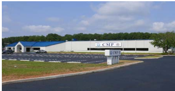
The second official CMP National Match Air Rifle competition will take place at the new Anniston Marksmanship Center on 14 March 2009.

event. Both will be fired on highpower rifle targets reduced for firing at 10 meters. Shooters will have the option of firing 1) sporter class air rifles (loaner air rifles will be available), 2) precision class air rifles or 3) competition air rifles built on AR-type platforms. This match will be held at the CMP's new Anniston Competition Center. During this match, the provisional courses of fire, paper targets and rules will be tested and evaluated. Competitors will be invited to